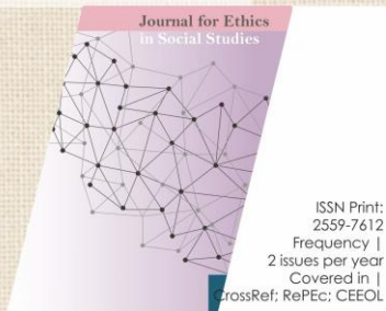
Journal for Ethics in Social Studies