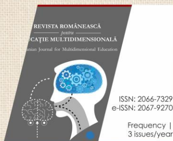
Revista Romanească pentru Educație Multidimensională

EBSCO; ERIH+; Google Scholar; Index Copernicus; Ideas RePeC; Econpapers; Socionet; CEEOL; Ulrich ProQuest; Cabell, Journalseek; Scipio; Philpapers; DOAJ; SHERPA/RoMEO repositories; KVK; WorldCat; CrossRef; J-GATE