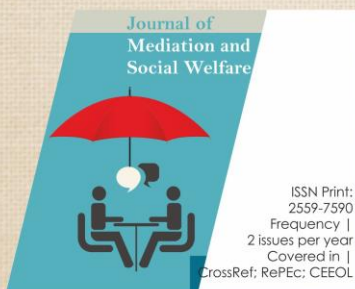
Journal of Mediation & Social Welfare