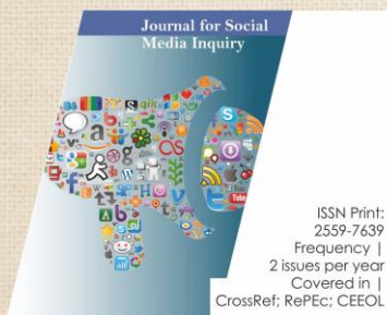
Journal for Social Media Inquiry