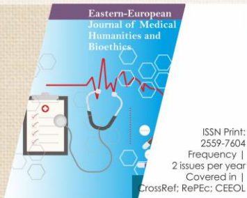
Eastern-European Journal of Medical Humanities and Bioethics