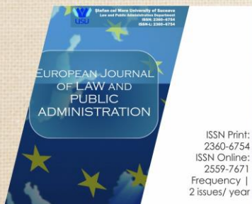
European Journal of Law and Public Administration

EBSCO; ERIH+; Google Scholar; Index Copernicus; Ideas RePeC; Econpapers; Socionet; CEEOL; Ulrich ProQuest; Cabell, Journalseek; Scipio; Philpapers; DOAJ; SHERPA/RoMEO repositories; KVK; WorldCat; CrossRef; J-GATE